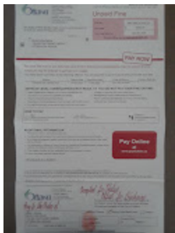
Racketeering and piracy.jpg 1580K